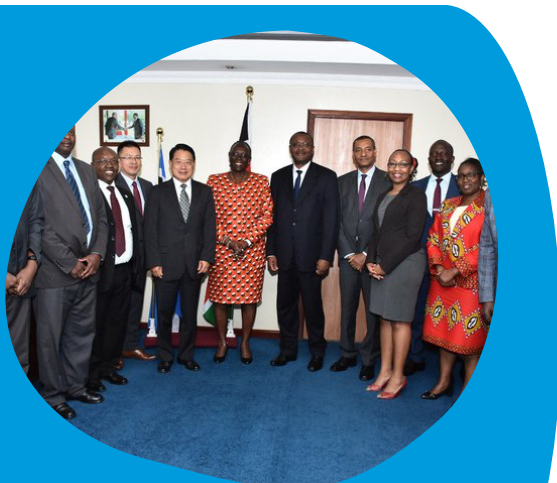
In September 2021, the OYA programme was included in the self starter Programme for Country Partnership (PCP) that was jointly signed by UNIDO and Kenya's government.

Outcome 1. Employability (on- and off-farm) and self-employment capabilities of youths in agriculture and agribusiness are enhanced